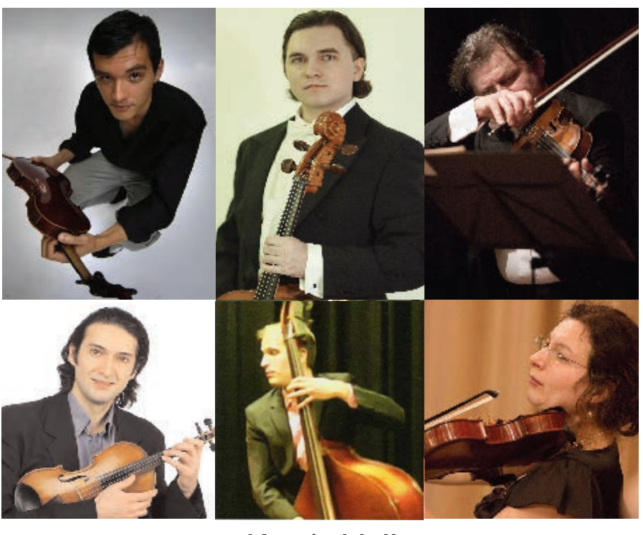
King's Hall Wednesday 13th March 2019